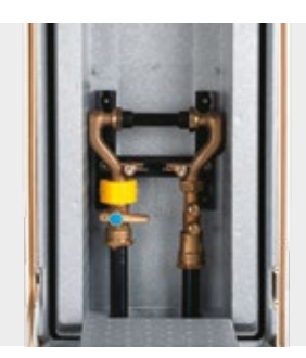
Lockable valve before meter PE 25 - without heat pipe

Example hydraulic fitting configurations with 1 DN15 - 110 mm meter