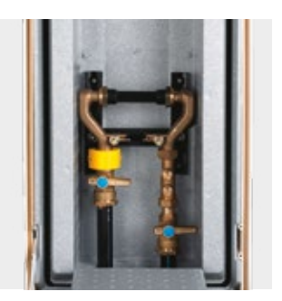
Lockable valve before meter + valve after meter PE 25 - without heat pipe