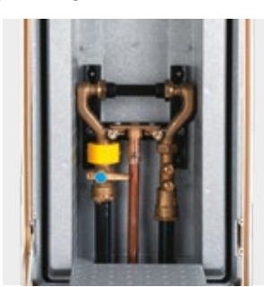
Lockable valve before meter PE 25 - with heat pipe