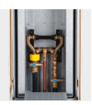
Lockable valve before meter + valve after meter PE 25 - with heat pipe